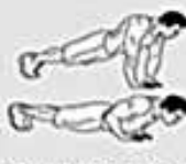
close grip push-ups