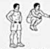
jump knee tucks