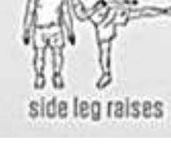
side leg raises