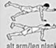
alt arm/leg plank